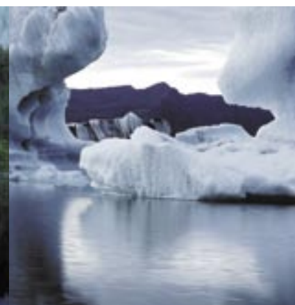
LEFT TO RIGHT: © CORBIS, © CORBIS, © CORBIS

peoples, local authorities, NGOs, the scientific and technological communities, trade unions, and women) attended the World Summit on Sustainable Development in Johannesburg. These groups organized themselves into approximately 40 geographical and issue-based caucuses. 35 But underlying this participation in the formal international sustainable