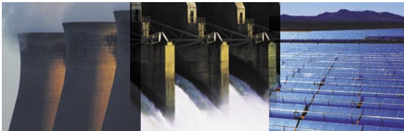
LEFT TO RIGHT: © DIGITAL VISION, © CORBIS, © CORBIS

national states, regions, and institutions as well as the social capital of relationships and community ties.